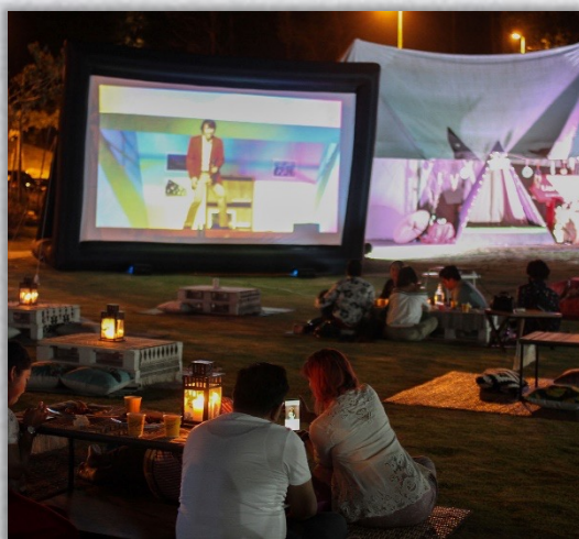
月光下电影院 Movie time under moonlight