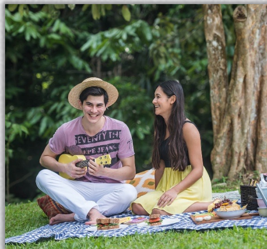
河边野餐下午茶 Picnic Afternoon Tea by the River