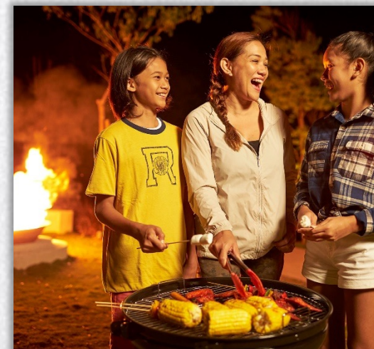
泳池旁烧烤晚餐 BBQ dinner by the pool

享受大自然和非一般的度假体验 Enjoy nature and an extraordinary holiday experience